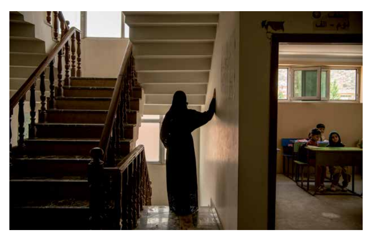
An Afghan woman poses for a portrait in her workplace.

are trapped. It shows how the Taliban's violation of any single right can have pernicious implications for the exercise of other rights. Cumulatively, Taliban policies form a system of repression that discriminates against women and girls in Afghanistan in almost every aspect of their lives.