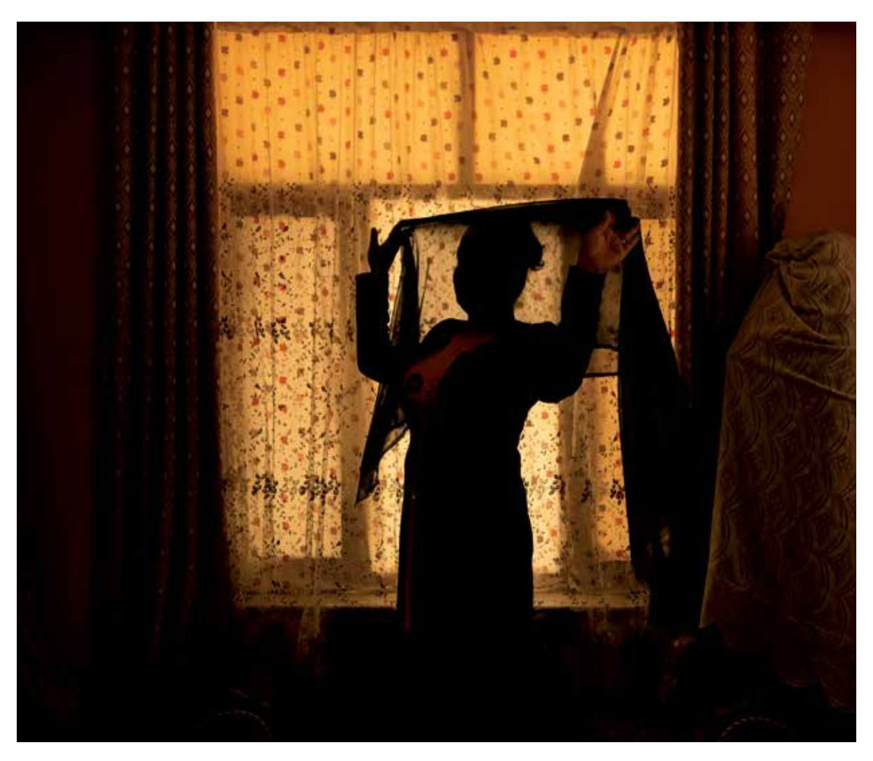
An Afghan woman poses for a portrait in her home.

• Urge the Taliban to accept international monitors in all detention centres, and ensure such monitors are able to conduct unscheduled visits inside all places of detention.