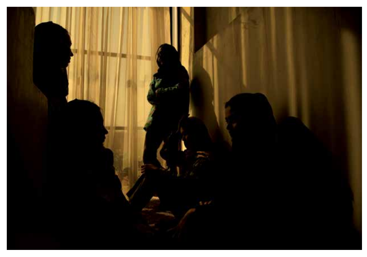
Afghan women pose for a portrait.

took control of Afghanistan, this system collapsed. Shelters were closed, and many were looted and appropriated by members of the Taliban. In some cases, Taliban members harassed or threatened staff. As shelters closed, staff were forced to send many women and girl survivors back to their families. Other survivors were forced to live with shelter staff members, on the street or in other unsustainable situations. Incomprehensibly, as the Taliban advanced across the country, they also systematically released detainees from prisons, many of whom had been convicted of gender-based violence offenses.