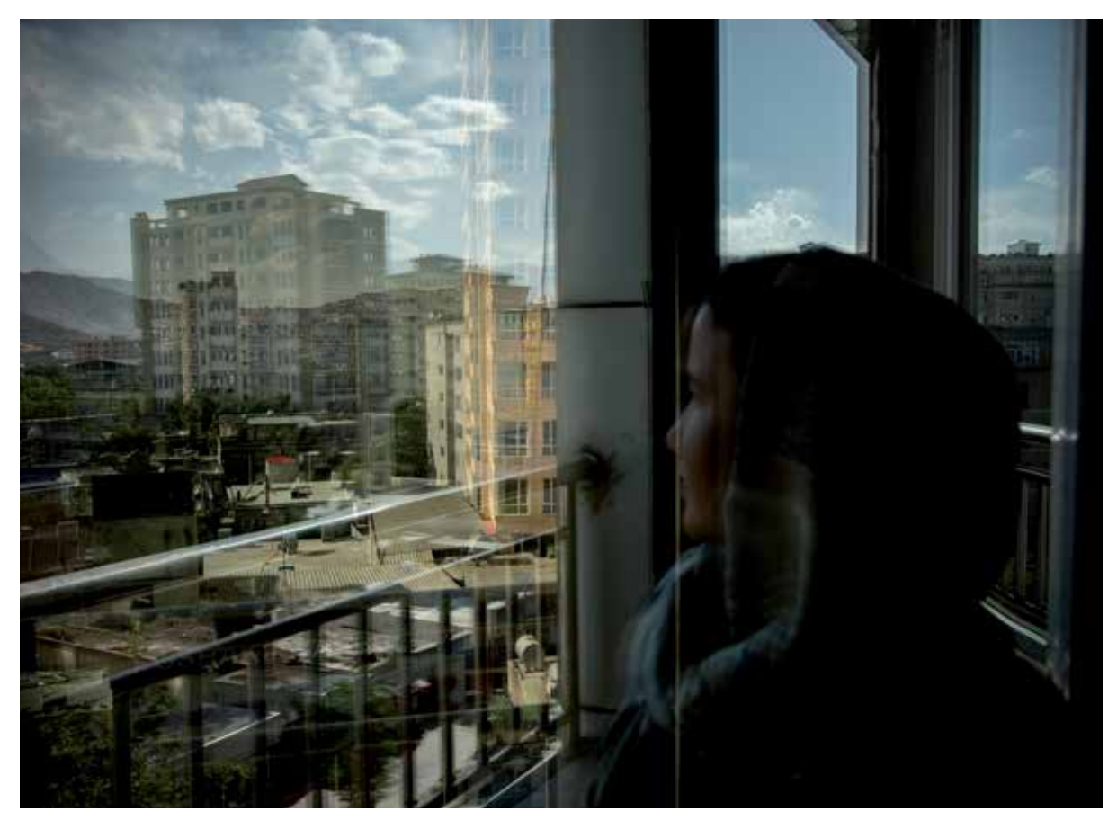
An Afghan woman poses for a portrait in her home.